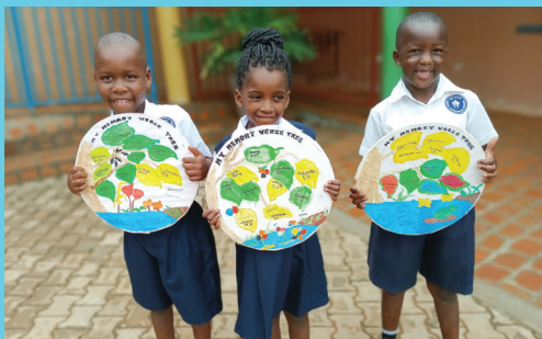
Shekhinah Memory Verse Tree

"I have hidden your word my heart that I may not sin against you." Psalm 119:11. The grade one students are proud of their memory verse tree project, reminding us to stay rooted in God's word. The word of God is life giving and so it is important that the students have the right foundation on which to stand as they go through life.