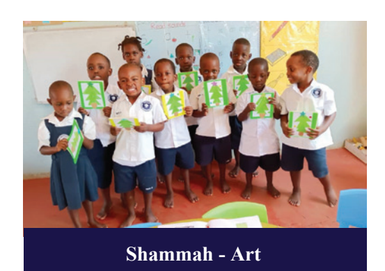
Shammah class continued to learn to draw, color, paint and paste things that God created. The Art center turned out to be their favorite this month. As December is a month in which we celebrate the birth of Jesus Christ, they made Christmas cards for family members and teachers.

The Sunbeams focused on reading and comprehension at their level. The book and listening center turned out to be their favorite this term, they leant many new words and have improved on vocabulary and speech. Reading has helped them to act out roles in the story and it has greatly improved confidence. The transportation books they made were a fun way to identify and learn about the means and types of transport and read related words.